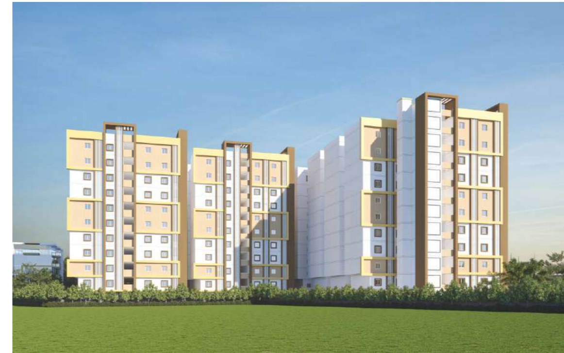
EXTERNAL VIEWS OF HIGHWAY HEIGHTS