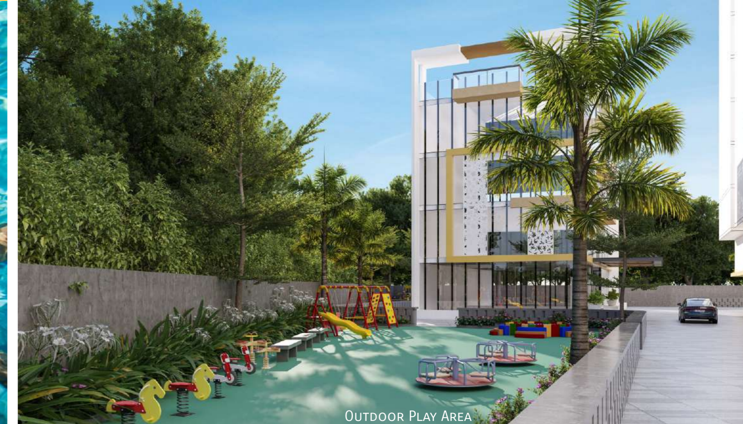
OUTDOOR PLAY AREA

A varied variety of relaxation and recreational activities defines an ideal lifestyle. Highway Heights lives up to its name by providing a plethora of recreational facilities to its residents. The expansive clubhouse is designed for every member of the family, ensuring exhilarating and memorable experiences that you will want to cherish forever.