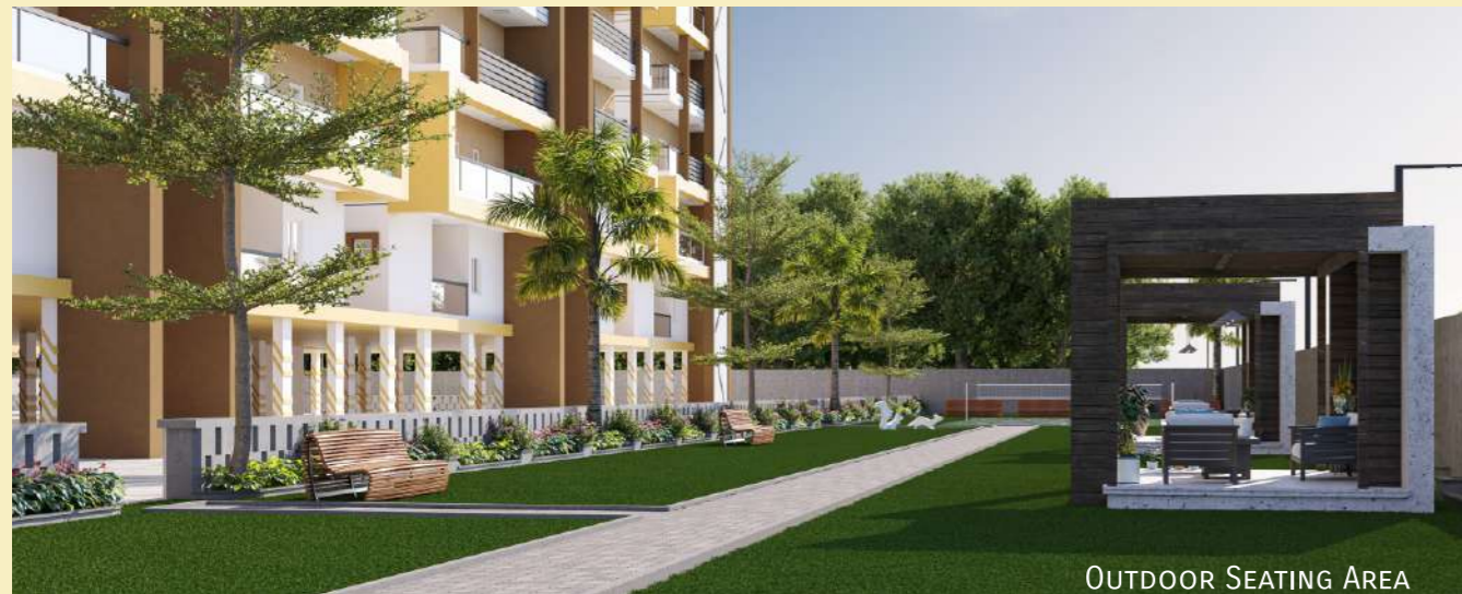
OUTDOOR SEATING AREA

Our highly experienced architects will ensure the use of high-quality materials and accessories to ensure durability and functionality.