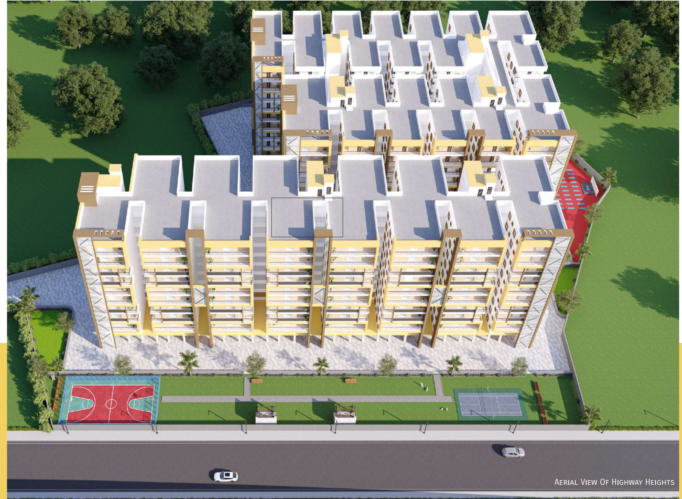
AERIAL VIEW OF HIGHWAY HEIGHTS