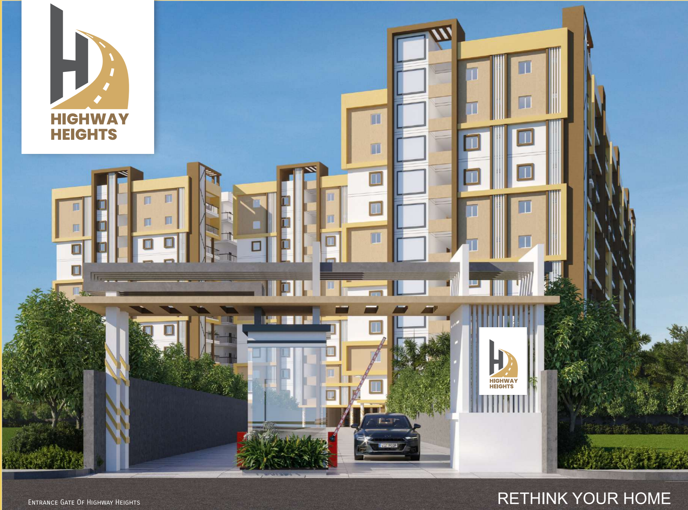
ENTRANCE GATE OF HIGHWAY HEIGHTS